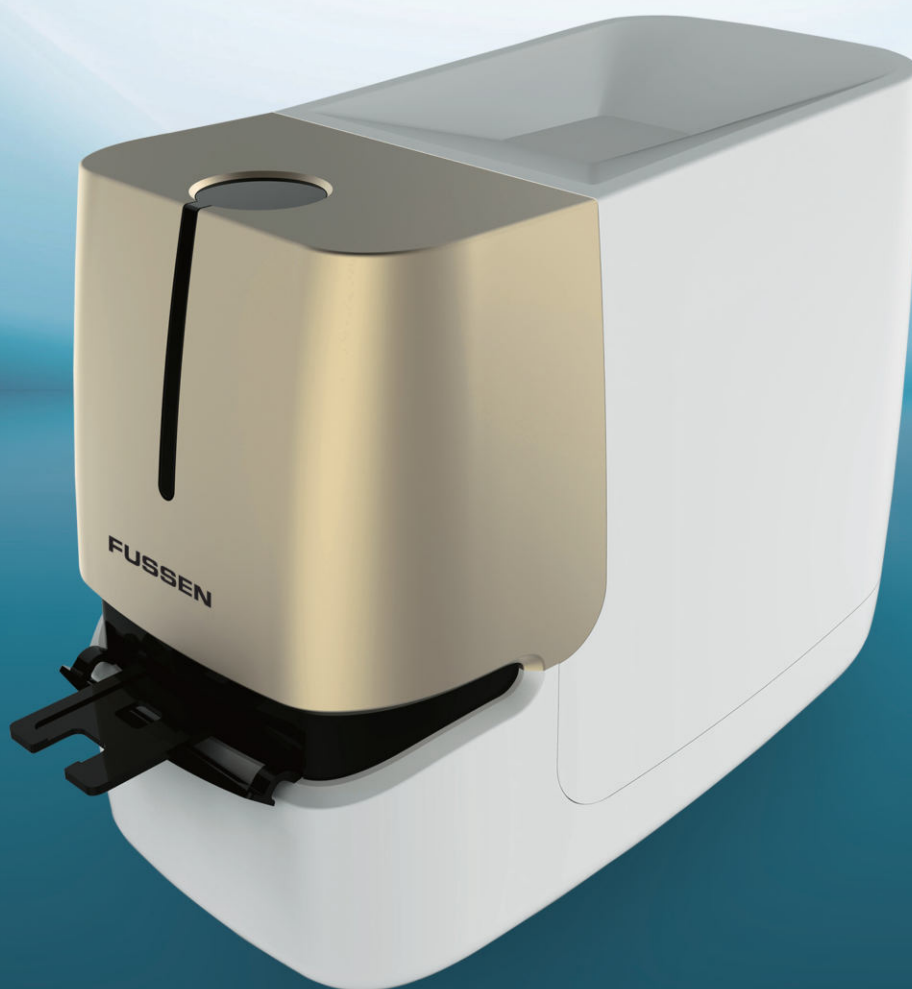
IMAGE PLATE SYSTEM

داینا دنت نماینده انحصاری فیوژن در ایران fussengroup.ir