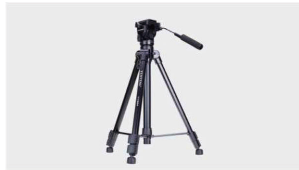
Remote control with a tripod and extended exposure hand brake line